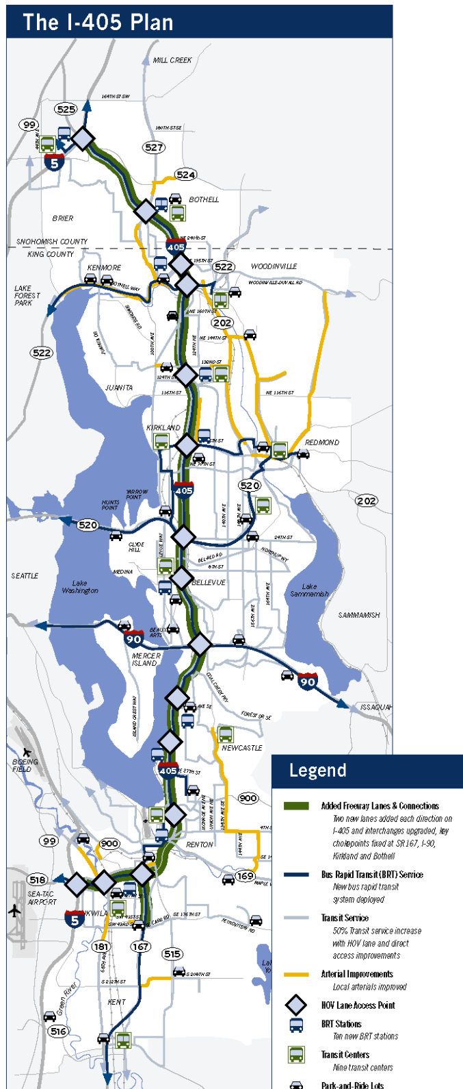
Figure 1 I-405 Corridor Plan Map | I-405 Corridor Plan, WSDOT 1999

Underlying the plan is a strategy of investment in transportation facility expansion and improvement within the Seattle region's designated Urban Growth areas.